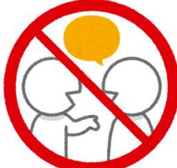
Avoid chatting loudly