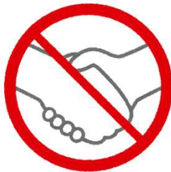
Avoid handshaking, high five, or a hug