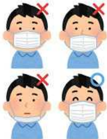
Wear a mask properly. Cover your mouth & nose.