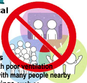
Avoid the 3C's Closed spaces with poor ventilation Crowded places with many people nearby Close contact settings such as close-range conversations