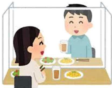
Definite no-no's are: Dining in large groups, Sharing the plates